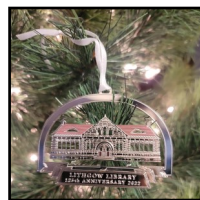
Holiday ornament $20.00

These proceeds go toward supporting the mission of the Friends.