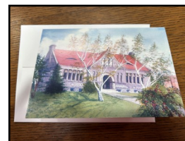
Notecards $5.00 each or 3 for $10.00