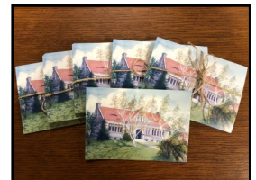
Postcards $5.00 for a bundle of five

You may also purchase non-resident membership gift certificates for someone.